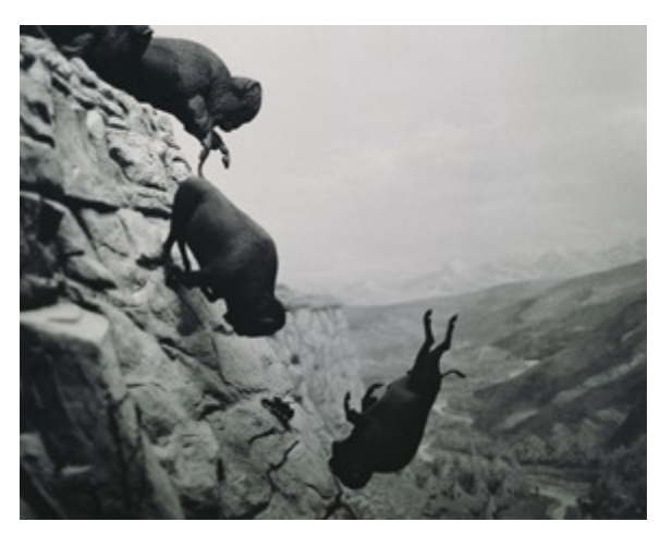
DAVID WOJNAROWICZ (Born Red Bank, New Jersey, 1954/Died New York, New York, 1992) Untitled (Buffalo) , (1988–89). Vintage gelatin silver print, 27 \frac{1}{2} by 35 \frac{1}{2} inches. Private collection, courtesy of the Estate of David Wojnarowicz and P.P.O.W Gallery, New York.

The art, in all manner of media, dates from 1981 to today.