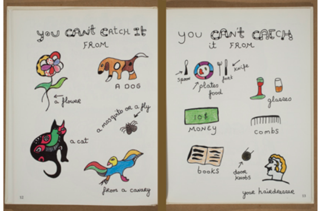
NIKI DE SAINT PHALLE (Born Neuilly-sur-Seine, France, 1930/Died California, 2002) AIDS, you can't catch it holding hands, 1987. Book, 52 pages, 8 by 10 inches. The Lapis Press, San Francisco © 2015 Niki Charitable Art Foundation. All rights reserved, Artists Rights Society (ARS), NY ADAGP, Paris.

"AIDS fundamentally changed American art, remaking its communicative strategies, its market, its emotional pitch and—not least—its political possibilities," Katz says in the release. "But we've repressed the role of AIDS in the making of contemporary American culture, as we've repressed the role of AIDS in every other aspect of our lives. This exhibition underscores how powerfully a plague that is still with us has changed us . Art AIDS America creates spaces for mourning and loss, yes, but also for anger and for joy , for political resistance and for humor, for horror, and for eroticism."